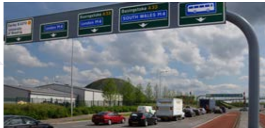
Direct routes to London, Basingstoke and The West