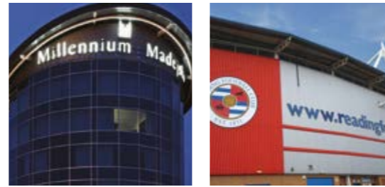
Millennium Madejski Hotel & Stadium

The prime and successful south Reading commercial area is home to a wide range of industrial & logistics, office, retail and leisure occupiers.