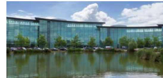
Reading International Business Park - Verizon UK HQ